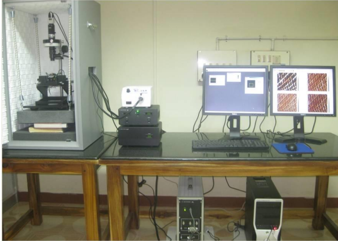
Atomic Force Microscope (AFM)