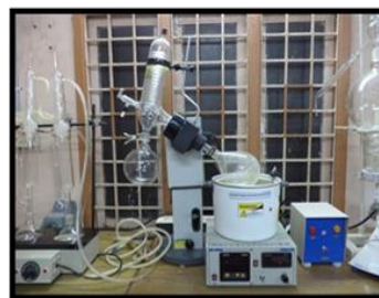
ROTARY VACUUMFLASH EVAPORATOR