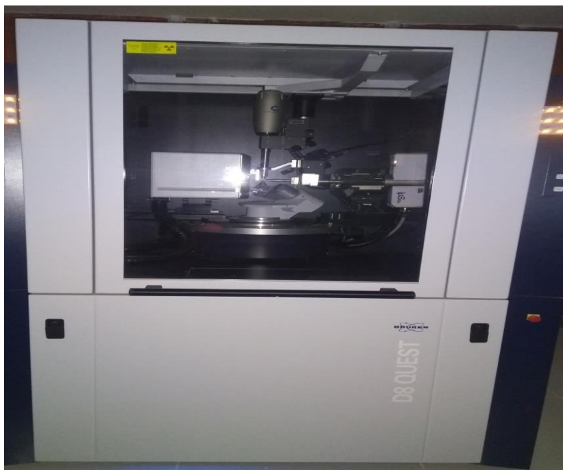
Single Crystal XRD (Bruker)