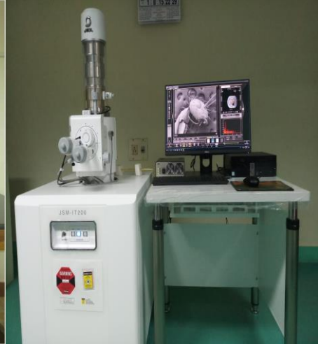
Scanning Electron Microscope - EDS (SEM-EDS)