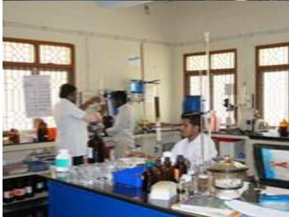
Instruments Lab - Marine Sciences