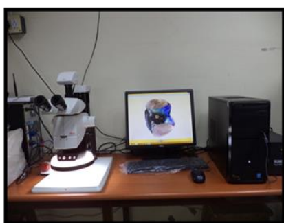
LEICA Stereo zoom microscope