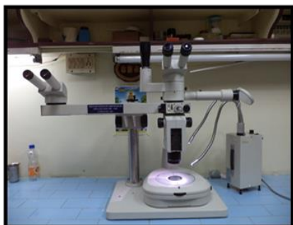
TRINOCULAR STEREOSCOPIC ZOOM MICROSCOPE