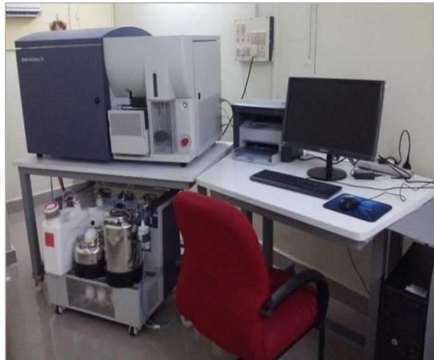
Flow Cytometer Cell Sorter (FACS)